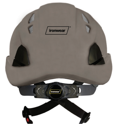
(Back with Ratchet)