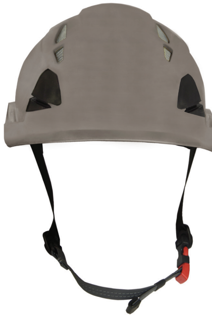
(Front with Chin Strap)